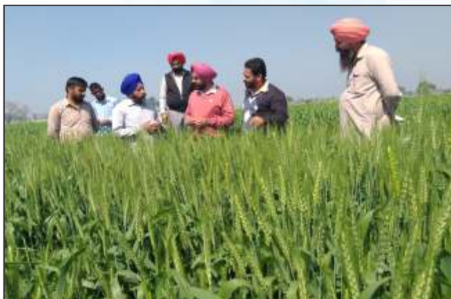
Farmer Scientist interactions at farmers field