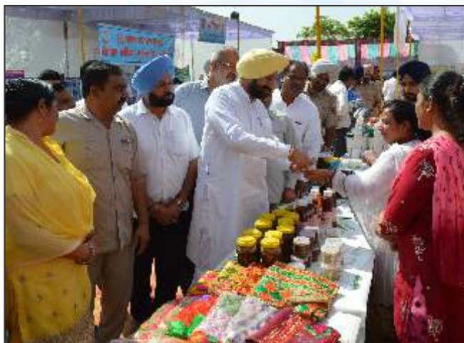
Exhibition stall by Self Help Group

programmes undertaken by the KVKs helps to disseminate various agriculture related technologies among farmers on a large scale. In this process the coordination with development agriculture and animal husbandry departments and private agencies is crucial for successful executing of extension programmes. Various extension activities were carried out by KVKs in coordination and collaboration with other line departments/agencies working in the district during the year 2018-19 are briefly presented here under. The activity wise details of extension programmes organized are furnished in Table 6.1. Data implies that KVKs' efforts through extension programmes covered a large number of farmers and created awareness about new technologies, activities and agri-enterprises.