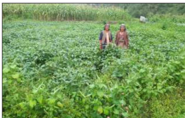
Demonstration on Soybean crop at KVK Shimla