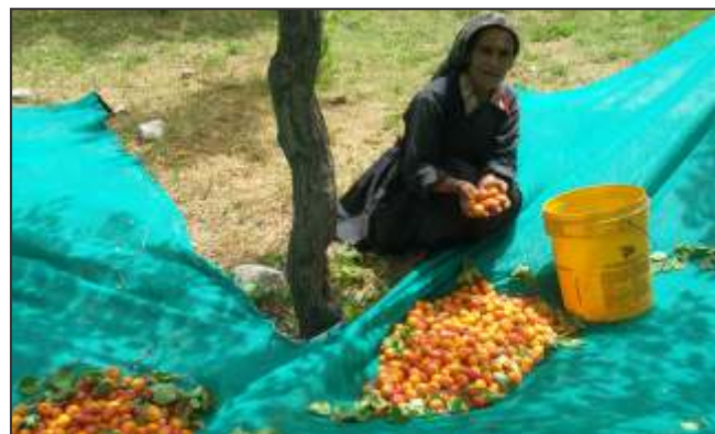
Apricot collection using safe harvesting net

To address the problems related to quality and economic yield in apricot, KVK-Leh extensively started promoting use of low cost Apricot harvest net developed by SKUAST-K, Leh in all the major belts for harvesting of high quality bruise free clean fruits. KVK Leh has 1255 nos. of demos at farmer's field in various apricot growing villages so as to aware and adoption of this technology. The farmers have a good response towards the technology demonstrated and they are enthusiastic in adoption of this technology.