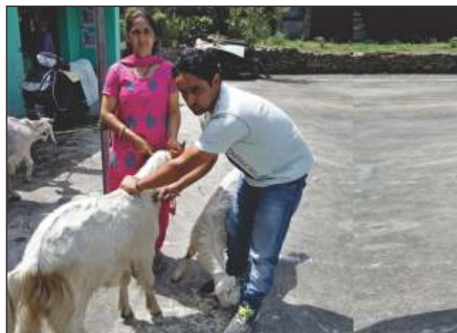
Vaccination against PPR