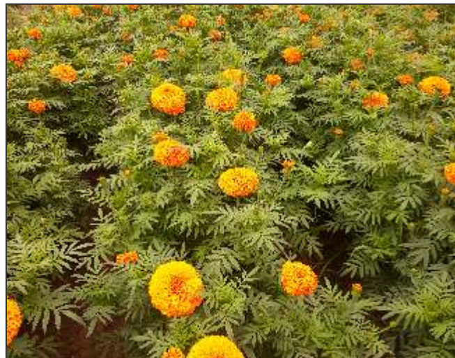
Table 3.19: Frontline demonstrations on flowers conducted KVKs