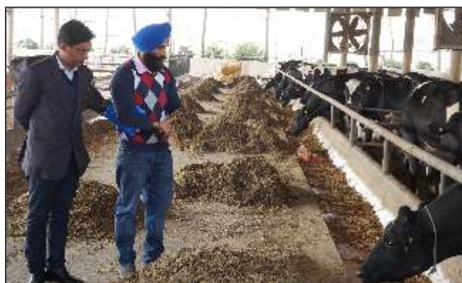
Feeding silage to animals