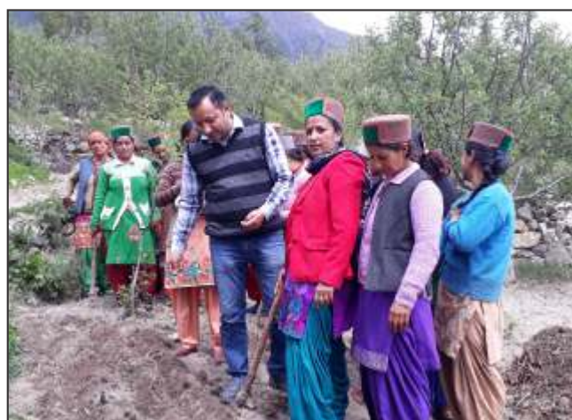
Method Demonstration on line sowing in Kinnaur

Frontline demonstrations on pulses viz. black gram, green gram, pigeon pea and rajmash were conducted to popularize improved cultivation practices. The highest percentage increment in black gram crop yield was recorded in Uttarakhand i.e. 50.00 per cent and lowest percentage increment in Punjab i.e. 24.97 per cent. Similarly, green gram demonstrations in Himachal Pradesh and Jammu and Kashmir recorded 56.25 and 40.91 per cent higher yield respectively was compared to the local check. Pigeon pea demonstrations in Uttarakhand recorded 69.18 per cent higher yield compared to that of the local check. Moreover, rajmash demonstrations in Himachal Pradesh and Jammu and Kashmir recorded 35.32 and 15.18 per cent respectively higher yield was recorded compared to the local check. This increase in yield can be attributed to the use of