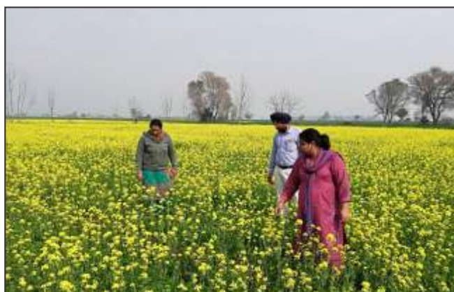
Demonstration on Rapeseed & Mustard Crop at KVK Amritsar

line sowing of crop, different intercropping systems, integrated pest management (IPM) etc. were demonstrated at the farmer's field. In varietal demonstrations, varieties like GSC 7, Giriraj & RH-749 were demonstrated in Punjab, Pant Pili sarsoo 1, TS67, Pusa Vijay, PR 20, PR 21, PPS-1 were demonstrated in Uttarakhand, DGS-1, RSPR-01, RSPR-69, KS 101, DGS-1, RLM-514 & CES-1, KS 101, SS 01, KBS 49 in Jammu & Kashmir and Neelam & ONK-1, GSC-7, Bhawani, RH-406, RH-749, PBR-357 in Himachal Pradesh.