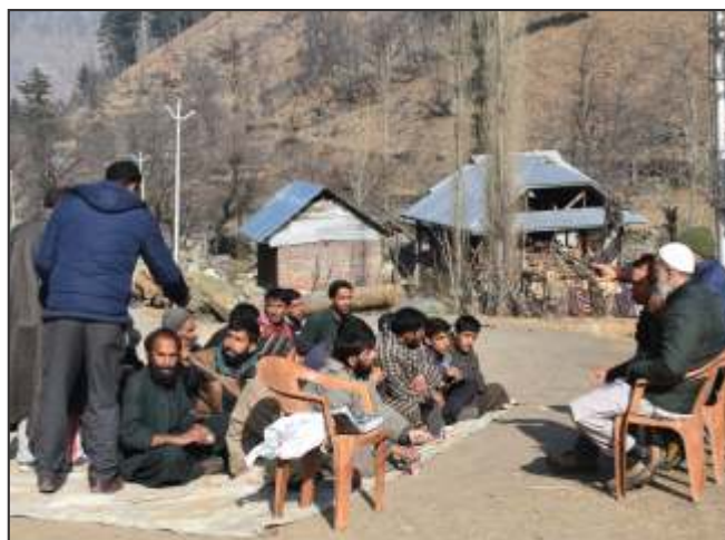
Training Programme on ICM in Pea in Bandipora

recorded 26.68 per cent higher than that of the local check. Similarly, the average yield increase of 20.15 per cent was observed in demonstrations on green gram in Punjab as compared to local check; whereas, it was 19.28 per cent in Himachal Pradesh.