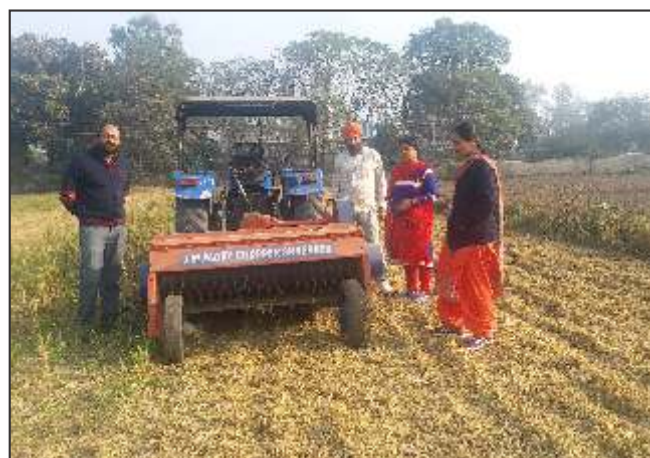
Farmer showing paddy straw shredder

However, being motivated by the KVK Kapurthala tried to find out the remedies for it.