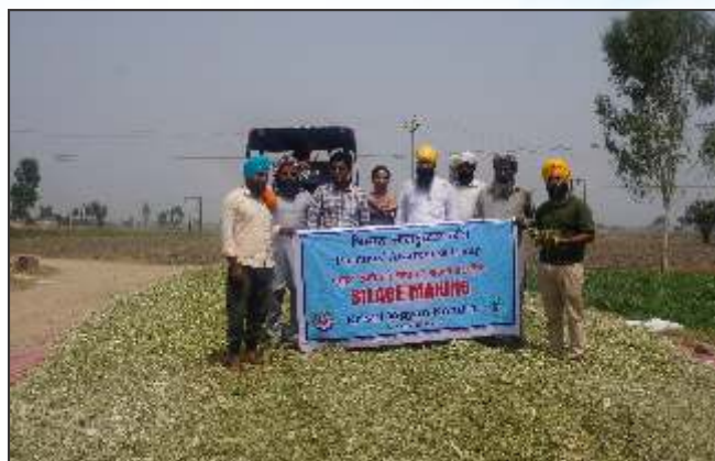
Silage making process

Regular supply of quality fodder is essential for ensuring attractive economic returns from the dairy farming. Contribution of forage in animal feed is more than 75% and is considered a cheap source of nutrients. Supply of green fodder throughout the year is limited due to extreme seasonal severity especially during May to June and November to December. Inadequate supply of quality fodder has been identified as one of the reasons for reduced livestock productivity. Less fodder supply issues in some months of the year can be resolved by converting fresh fodder in to silage when fodder production is at higher level.