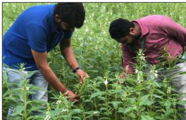
Demonstration on Sesame crop at KVK Nawanshehar