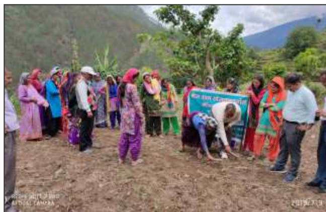
Method Demonstration on line sowing at Chamoli

During the 2018-19 year, KVKs under the TSP scheme conducted 545 OFTs and 6246 FLDs in farmers' fields. A total of 39534 farmers and 11807 extension personnel attended the training programmes organized