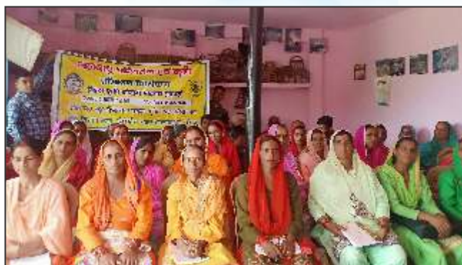
DAMU Awareness at Sirmaur