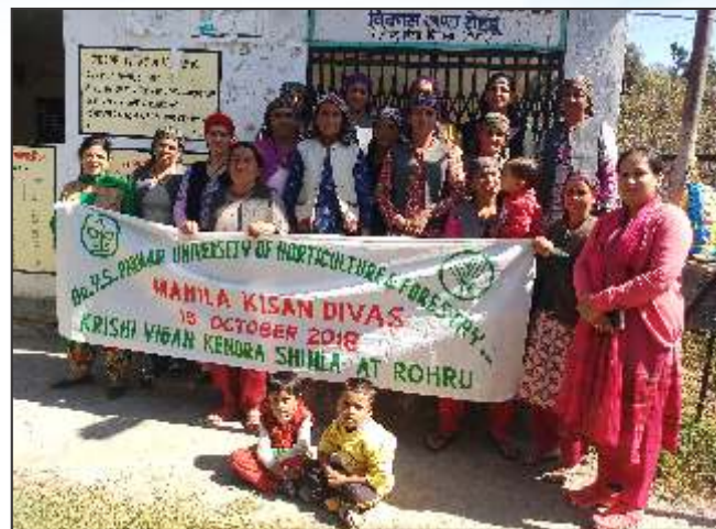
Mahila Kisan Diwas

A total of 48108 extension programmes were organized through different methods and means wherein technologies related to agriculture and allied sectors