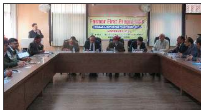
Zonal Review Workshop organized at ICAR-ATARI, Ludhiana