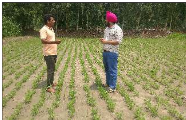
Monitoring of Groundnut crop at KVK Hoshiarpur

Himachal Pradesh, Jammu & Kashmir, and Uttarakhand with 27.3, 27.18 & 22.1 per cent in comparison with the local check. For soybean, Uttarakhand recorded highest yield increase of 46.8 per cent followed by Himachal Pradesh with 45 per cent increase in comparison with the local check.