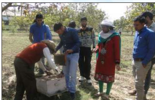
Training program on bee keeping under ARYA

Barnala in Punjab, Solan in Himachal Pradesh, Nainital in Uttarakhand and Reasi, Kulgam and Baranulla in J&K during 2018-19.