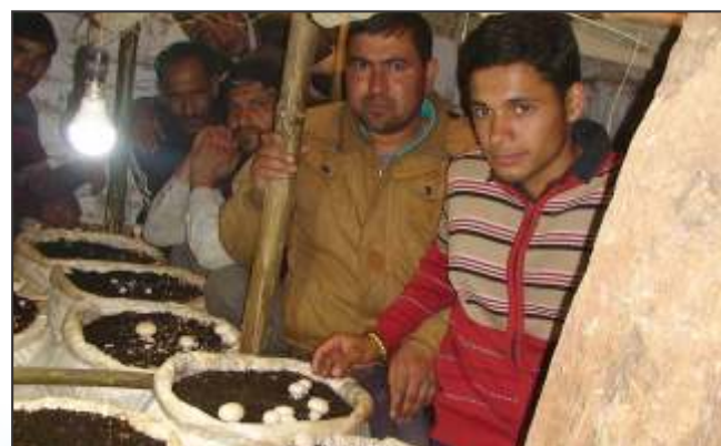
Skill development training on Mushroom growing