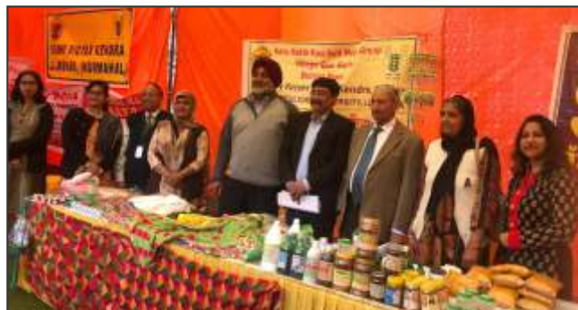
Entrepreneur showing different processed products

more technical input to improve the scale of her business.