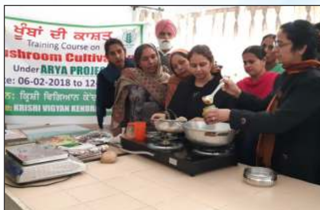
Pickle making during training on Mushroom Cultivation

Division of Agricultural Extension, ICAR, New Delhi sanctioned ₹ 112.94 lakh (Revised Estimate) to the institute during 2018-19 for implementing the project in Zone-I. A total of 21 training programmes were organized by the ARYA centres during the year in which 508 rural youths got benefitted (Table 5.16). These trainings included theory-based lectures, method demonstrations, and hands-on-practice. Rural youth were trained on various agricultural & allied enterprises viz. bee keeping, value addition & processing, mushroom cultivation, poultry farming, protected cultivation and nursery raising of vegetables and commercial floriculture. In addition to these training programs exposure visits to the successful enterprises