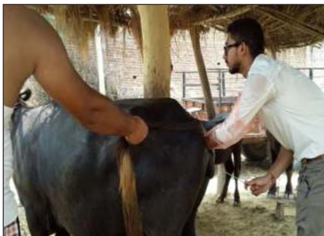
Artificial Insemination at Ferozepur

Mantri Fasal Bima Yojana (PMFBY). In KKA-II seven districts covered 1834 villages in this phase of Abhiyan. In Gramin Haats, marketing and supporting infrastructure was strengthened using MGNREGA and other Government Schemes for the benefit of the farmers. Five KVKs i.e. Moga, Ferozpur, Haridwar, Chamba, U.S. Nagar developed the Gramin haats for Gramin Agricultural Markets (GrAMs). In PMFBY program, 117 villages were covered and 725 farmers attended this crop insurance programme. During KKA-II, 231 more villages were benefitted by this Abhiyan as compared to KKA-I in these seven Aspirational Districts of Zone-I. Funds were provided to KVKs for construction of 300 NADEP pits @ ₹ 7000 per pit in 15