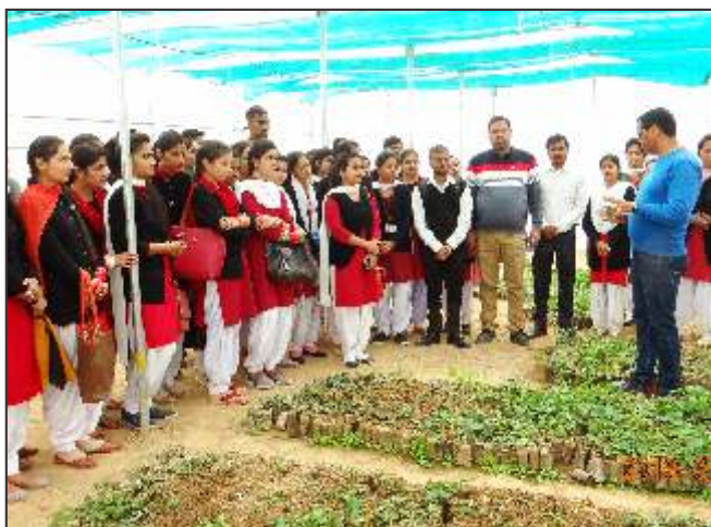
Students exposure visit nursery farm