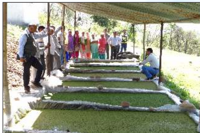
Training programme on Azolla making