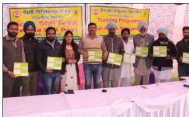
Recipients showing soil health cards