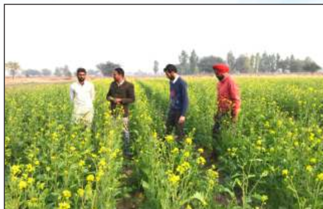
Farmer & scientist interaction on Rapeseed & Mustard crop at KVK Bathinda