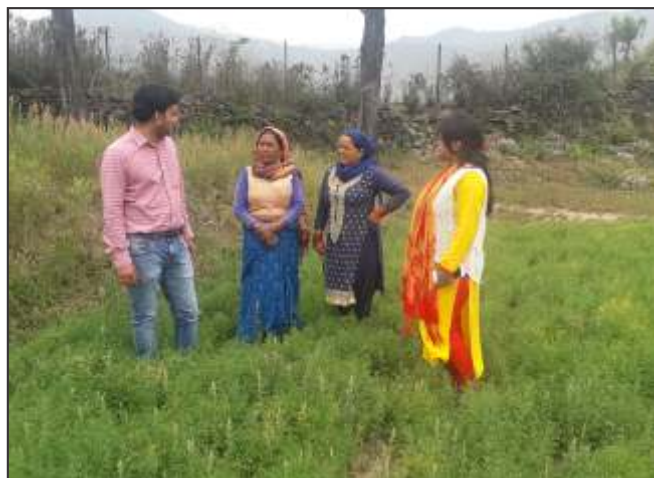
Diagnostic visit in Tehri Garhwal

recorded 26.68 per cent higher than that of the local check. Similarly, the average yield increase of 20.15 per cent was observed in demonstrations on green gram in Punjab as compared to local check; whereas, it was 19.28 per cent in Himachal Pradesh.