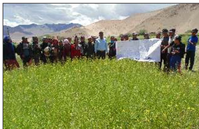
Demonstration on Rapeseed & Mustard Crop at KVK Leh