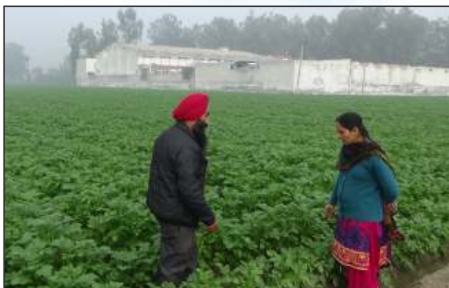
Healthy potato crop in residue incorporated field

the quality of output as the size of potato became larger while the length and girth of carrot increased. The colour of the potato tubers was much better while the nail in the carrot crop was thinner.