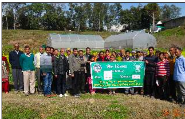
Field day on Rapeseed & Mustard crop at KVK Bilaspur