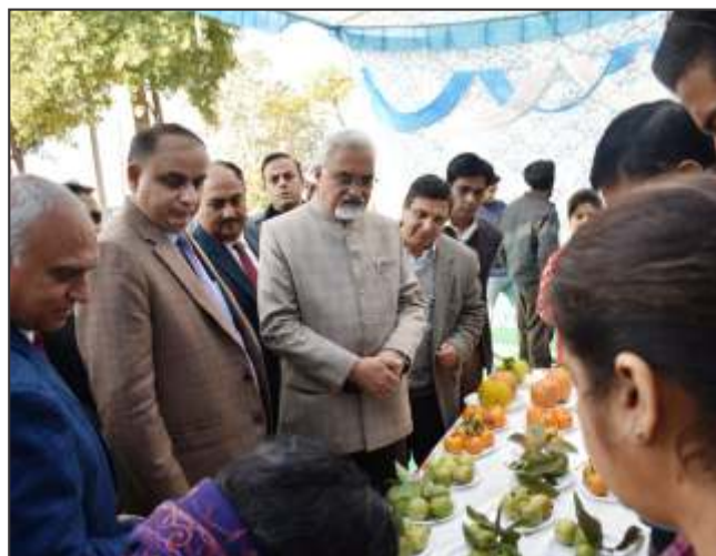
Awareness programme at KVK Jammu

participated in these awareness cum training programmes.