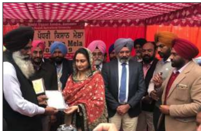
Kisan Mela at KVK Bhatinda

In KVK Haridwar Sh. Ramesh Pokhriyal 'Nishank' Union Minister of Human Resource Development Govt. of India attended the mela and motivated the farmers for diversification and use of high yielding varieties.