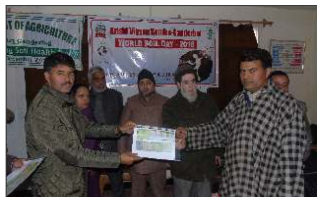
World Soil Day Celebration