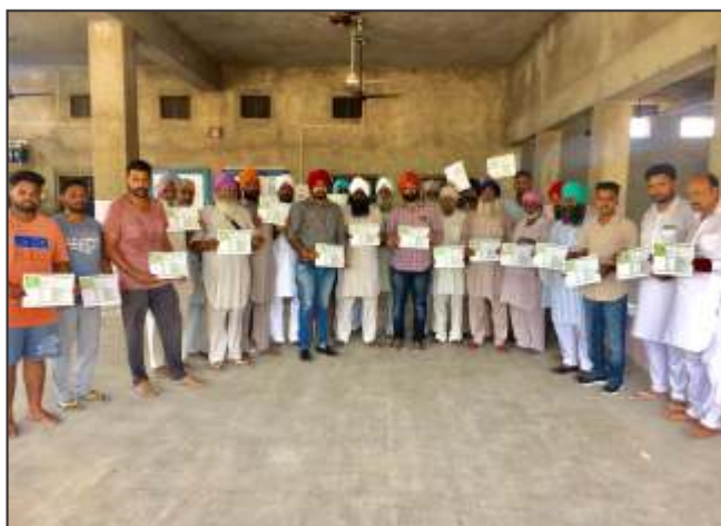
Distribution of soil health cards