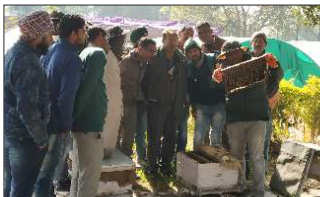
Skill development training on bee keeping

own enterprise or get self-employed. A total budget outlay of ₹ 170.68 lakhs was sanctioned and released to the training centres for conducting these skill development courses in agriculture or allied areas. A total of 1794 rural youths successfully completed these skill development courses. Out of total 90 skill development programmes, 71 courses were conducted by 38 KVKs, 15 courses by 7 SAUs and 4 by ICAR Institutes of this Zone.