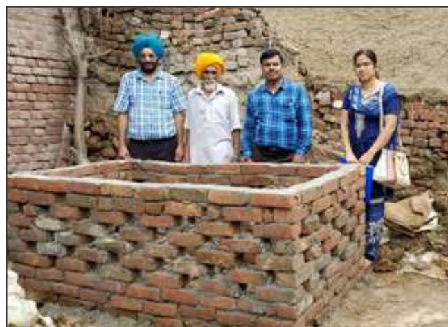
Construction of NADEP Pit

Glimpses of the activities conducted during Krishi Kalyan Abhiyan