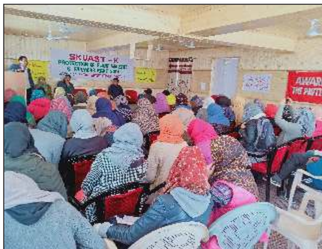
Awareness programme at KVK Kargil