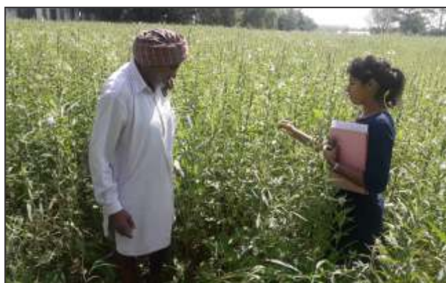
Demonstration on Sesame crop at KVK Ropar