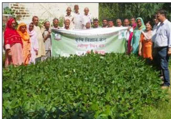
Field visit in Hamirpur

Scientific cultivation and improved practices of chick pea, lentil and field pea crops were demonstrated in the states of the zone. The highest yield increased was recorded in chick pea crop in Jammu and Kashmir (46.82%) followed by Himachal Pradesh (45.26%), Uttarakhand (25.43%) and Punjab (24.48%). Similarly, the highest percentage increment in lentil crop yield was recorded in Himachal Pradesh i.e. 42.39 per cent and lowest percentage increment in Jammu and Kashmir i.e. 16.51 per cent. Moreover, field pea