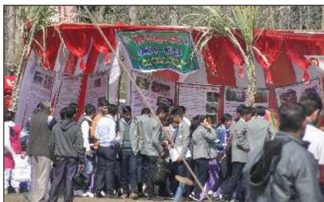
Exhibition during Kisan Mela at KVK Haridwar