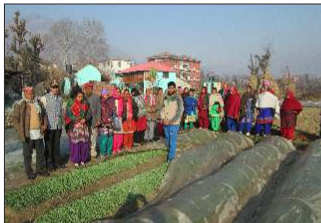
Field visit of Farmers, CSKHPKV, Palampur