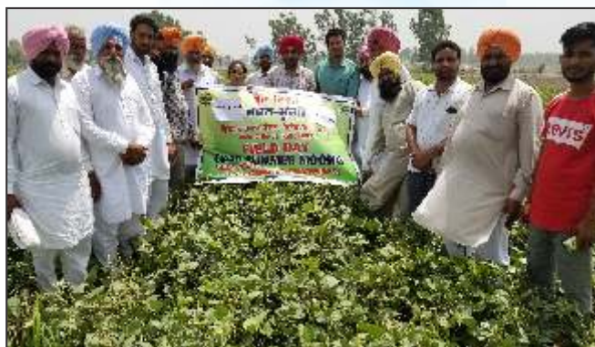
Field Day on Summer Moong at Ferozpur

climate variability on farmers' fields and make the Indian agriculture climate resilient. In Zone-I, 13 most vulnerable districts which are covered under Technology Demonstration Component (TDC) of NICRA are namely, Bathinda, Faridkot, Fatehgarh Sahib, Ropar, Hamirpur, Kinnaur, Kullu, Chamba, Kathua, Pulwama, Bandipora, Tehri garhwal and Uttarkashi.