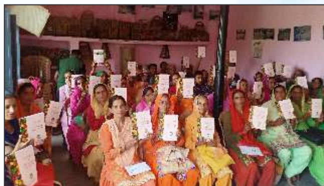
Literature for Climate Change