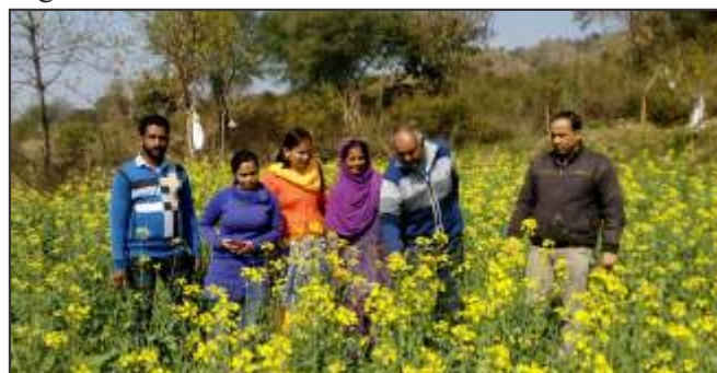
Table 3.6: Frontline demonstrations on oilseeds conducted in Punjab

KVKs of Himachal Pradesh conducted a total of 218 demonstrations on oilseed crops covering an area of 27.60 ha during the year under report including 97, 40 and 81 demonstrations of rapeseed & mustard, sesame and soybean, respectively (Table 3.7). The technologies demonstrated on various crops under oilseeds performed better than the local check in terms of yield and other attributes. The increase in demonstration yield over local check varied from 6.78 to 33.96 percent. The BC ratio of all the demonstrated technologies was also observed higher than the local check.