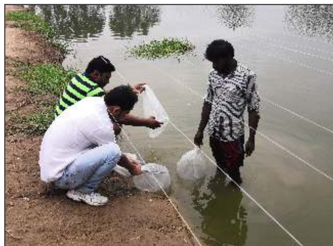
Fingerling management in fish farming