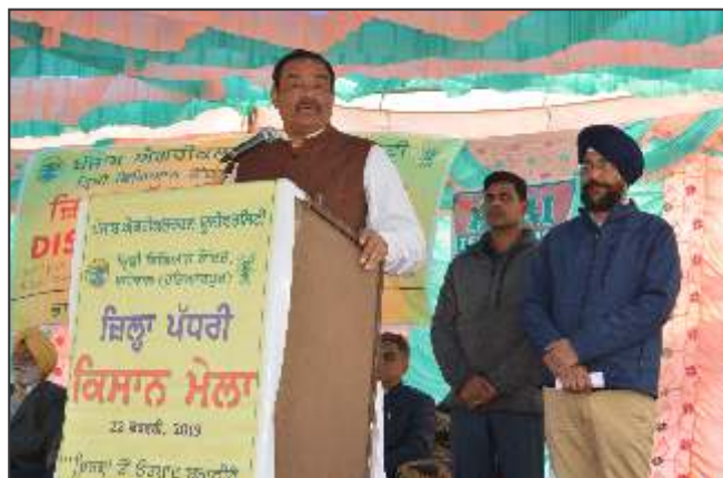
Kisan Mela at KVK Hoshiarpur