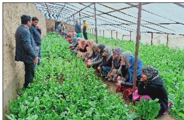
Nursery Demonstration at KVK Kargil