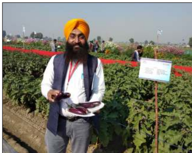
Healthy and robust harvest of brinjal

Protected Cultivation and Nursery raising. With the guidance of KVK, he purchased various instruments like rotavator, nursery bed maker etc. The nursery beds on his farm are raised 15 to 20 cm from the ground level and seeds of cauliflower, cabbage, tomato, brinjal, chilli, onion and capsicum are raised in lines after adopting package of practices by PAU, Ludhiana. The nursery of these vegetables is irrigated with sprinkler system thus resulting in a significant saving of water resources. He uses a Laser land leveler in his field every year which improves water use efficiency in his horticulture crops. Training on all these techniques is provided to him by KVK experts. He got a Pack-house constructed at his farm under NHM where the vegetables are properly sorted, graded and packed before dispatch to various outlets and mandis .